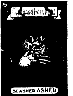
Figure 1.3 - Slasher Asher, one of the missing cards out of KoolKarl's Garbage Pail Kids set.

by KoolKarl collector of Garbage Pail Kids