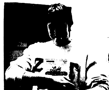
Figure 1.2 - An artist's rendering of KoolKarl