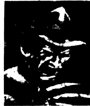
Figure 1.1 - An artist's rendering of Freddy Krueger