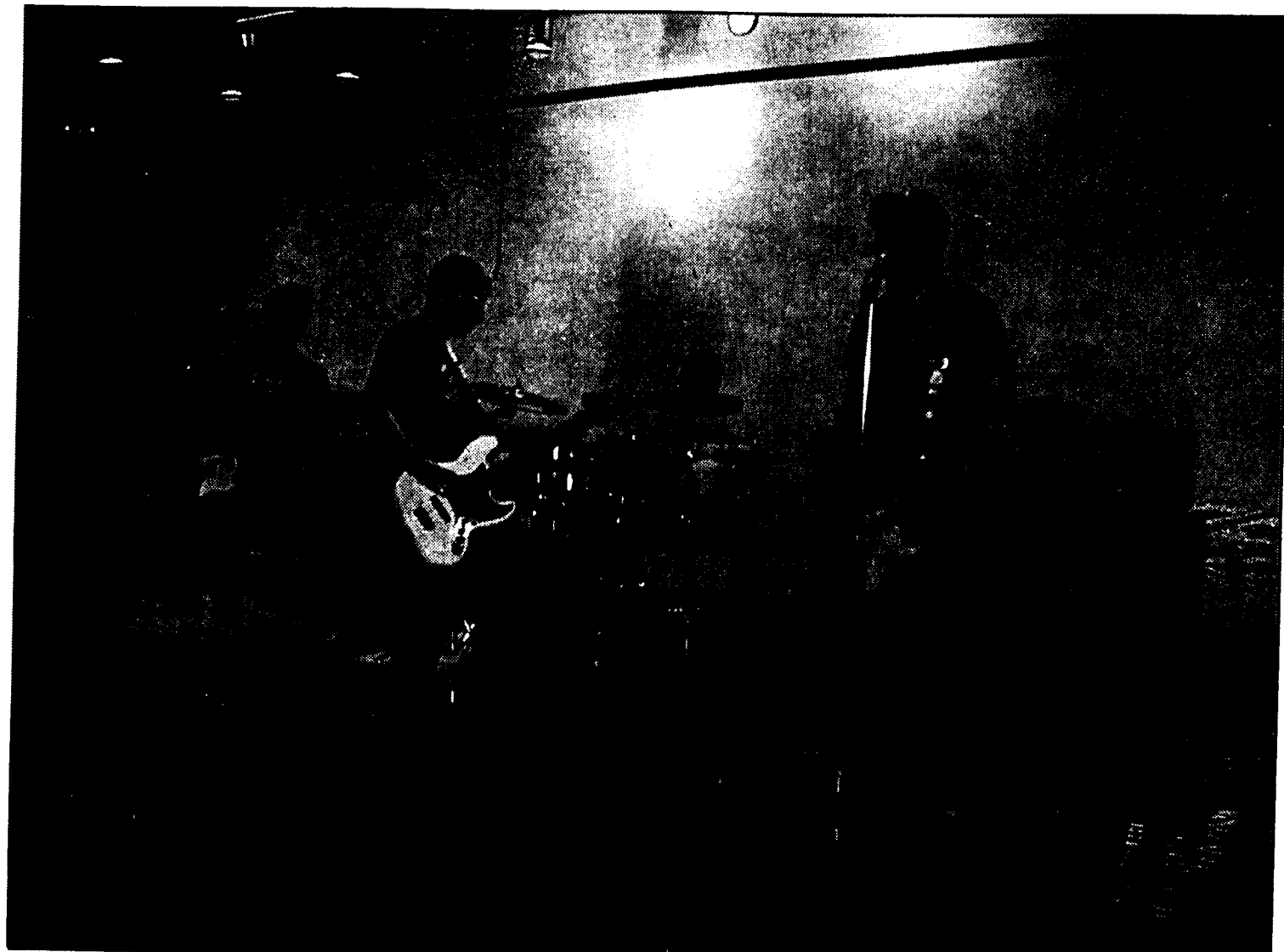
The Twirpentines grace Bruno's with their punk-rock artistry.