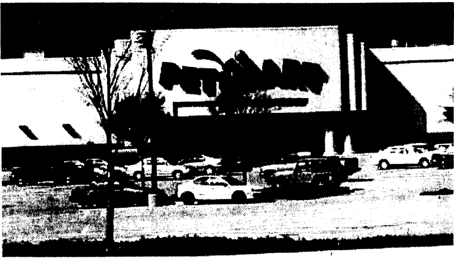
Pet Smart is located at 7451 Peach St. near Circuit City.