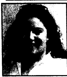
Michelle Armstrong Senator