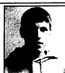
Jason Snyder Senator