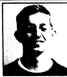
Doug Bailly Senator