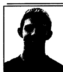
Bill Hogan Senator