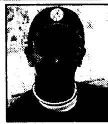
Sundeep Bhatia Senator