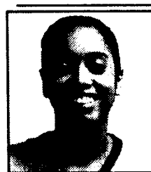
Jennie Ellison Senator