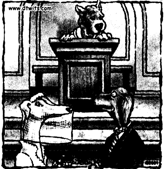
"You may sniff the bride."