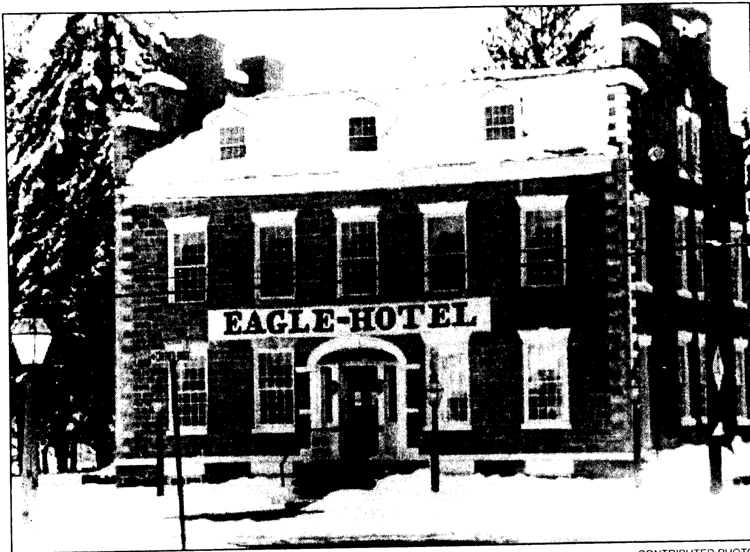
This is the Eagle-Hotel, which is located in Waterford.

It seems everybody wanted to build their fort in Waterford; the French, the British and then the Americans successively built forts there during the 18 th Century. The French left in 1759, and burned down their own fort. The British took over the area and built a fort that was then burned down by Native Americans in 1763. No one burned down the American settlement that followed, and the town of Waterford was laid out by