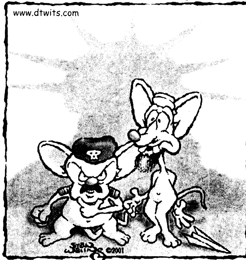
"Egads, Brain, whatever shall we do (NARF) now?"