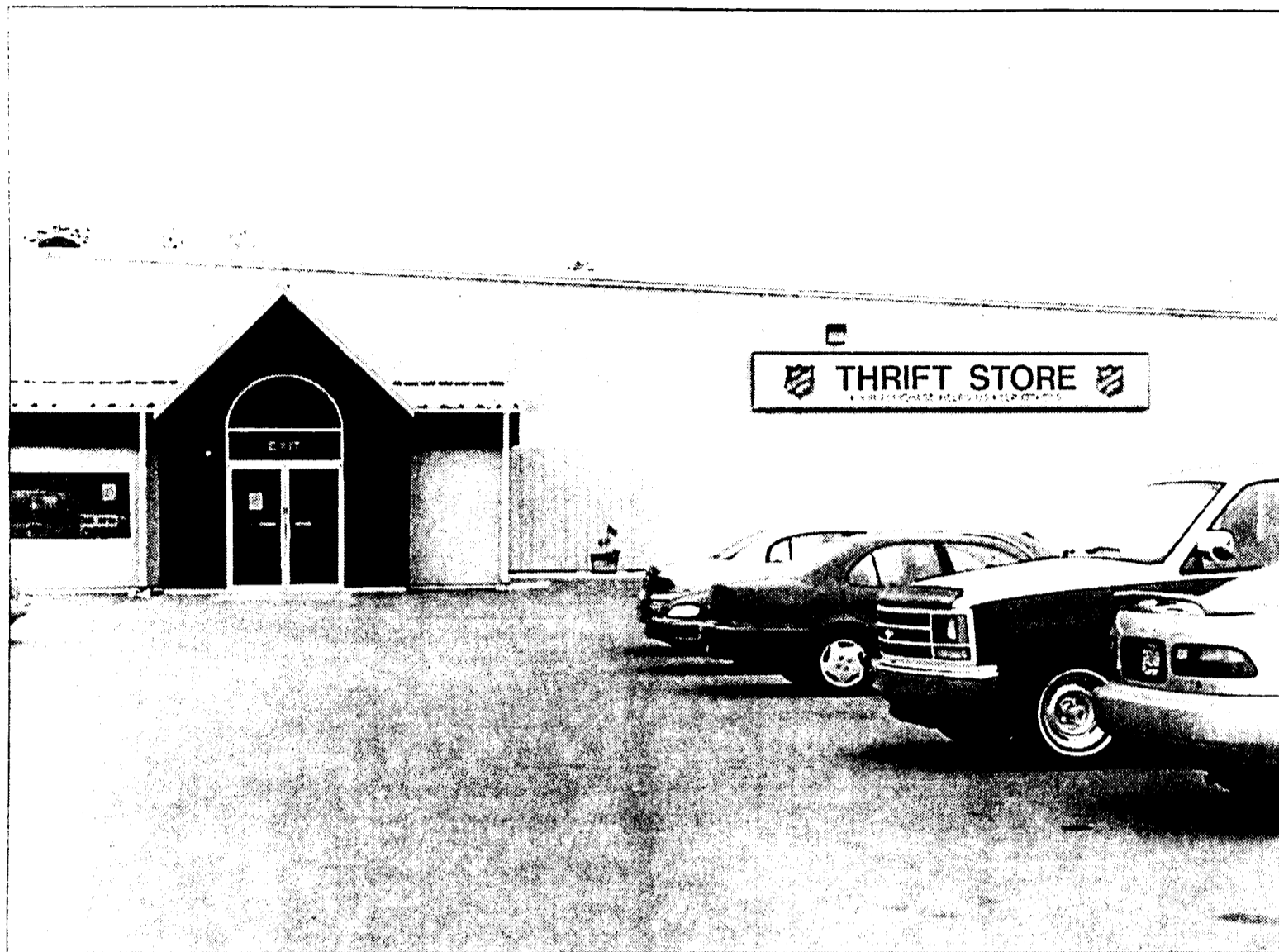
The Salvation Army has a number of locations in Erie, including Peach Street (above) near Taco Bell.