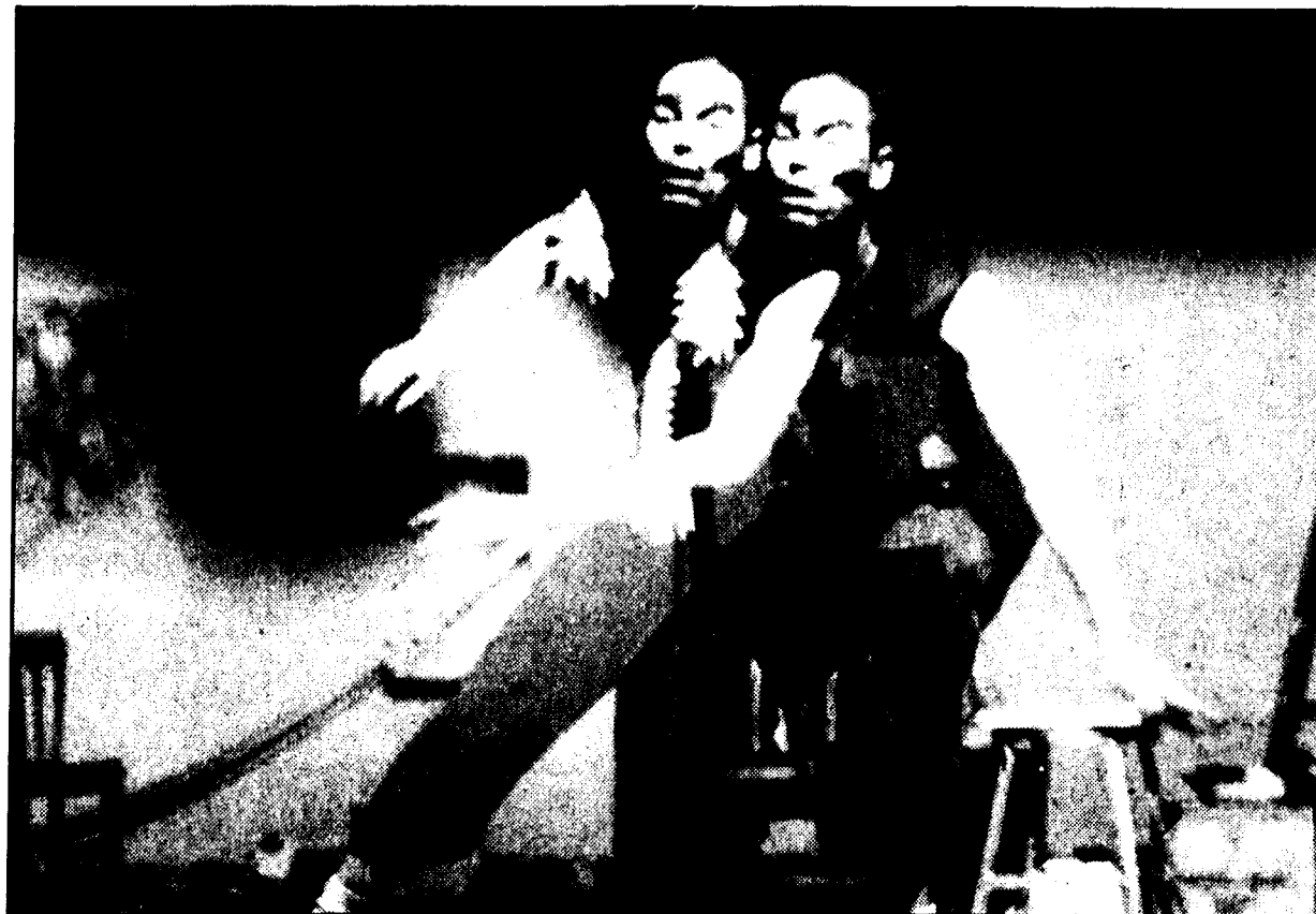
"Some Parts Missing or Broken," a one-man performance piece, will take place at Behrend's Studio Theatre Sept. 14 and Sept. 15 at 8 p.m.