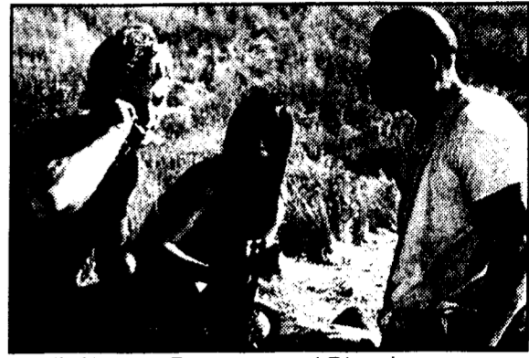
L to R: Walker, Brewster, and Diesel.

For those of you tightwads out there looking to save a dime, go to the dollar theater and check this one out. Who knows, maybe some other idiot will be tearing the seat covers when the action is out of control.