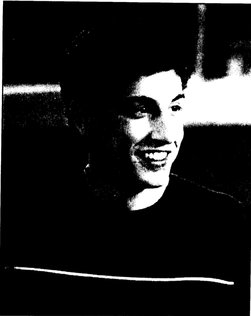
Jason Biggs returns with the original "American Pie" crew for the tasty sequel which opened on August 10.

The last scene clenches the entire movie together, and can only be seen, not talked about. If you are one of the few college students who have not ventured out to see one of the most perverted and realistic movies of the summer, this one is waiting for you.