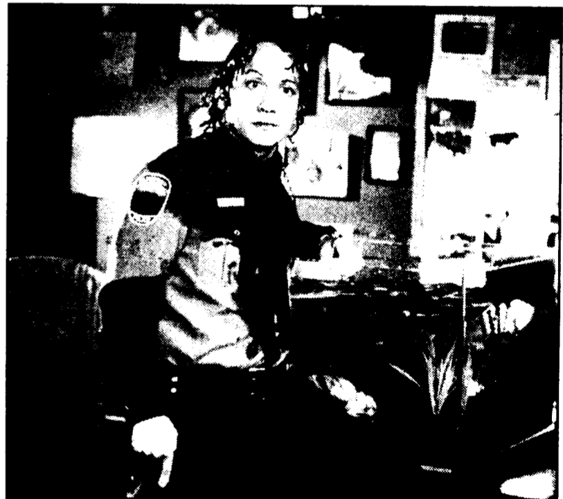
Rob Schneider in "The Animal"

This film is a lighthearted comedy that will definitely crack a smile. With Adam Sandler as a producer, laughter is definitely in the recipe. Go and see it after a stressful day and you will never look at a goat or a mailbox in the same way again.