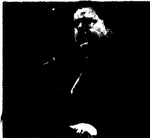
Congressman Phil English speaks to Behrend students during lunch at Bruno's.