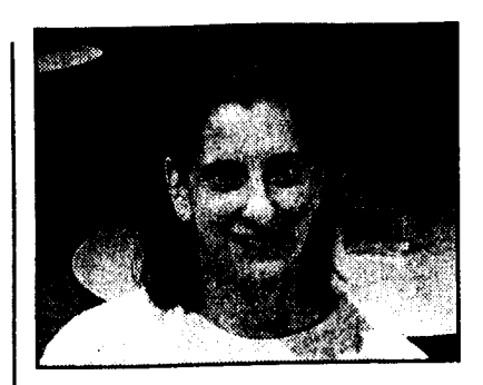
"I'm looking forward to the spring weather, when it's warm."