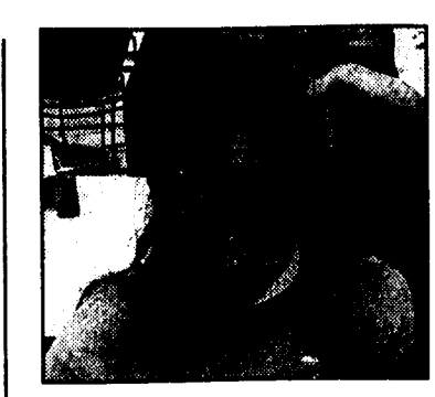
"I'll never live in the north again — I'm probably going to move south after this, I hate the snow."