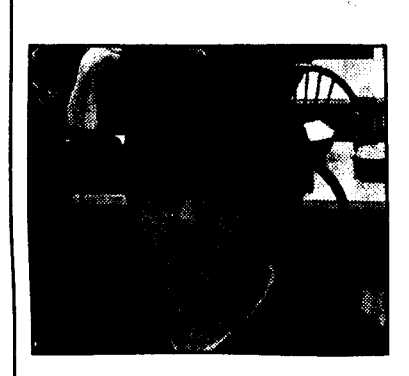
"It was too cold — nothing happened in Erie."

How do you feel about living through Erie's snowness winter on recent?