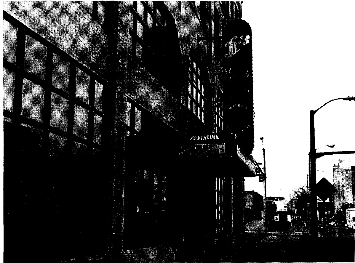
JR'S Last Laugh is located on 1402 State Street.