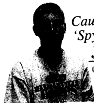
Caught in the 'Spyder' Web