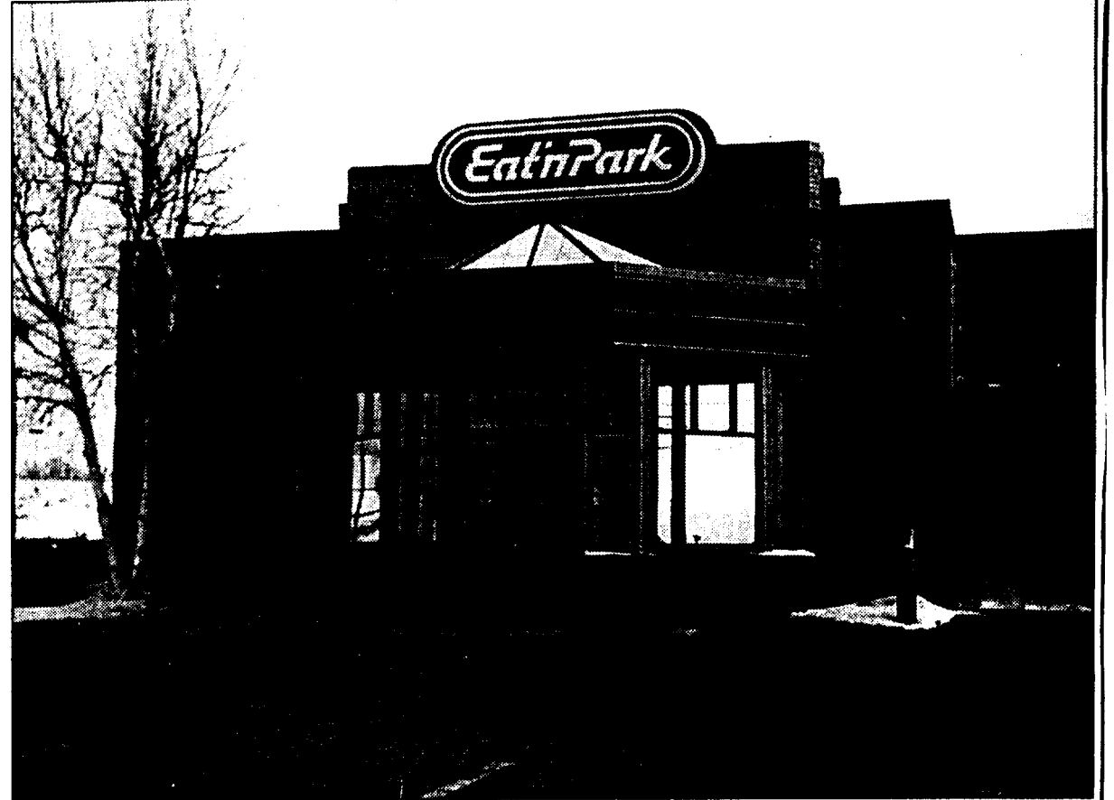
Eat N' Park has two locations, one on Peach Street and one on West 12th.