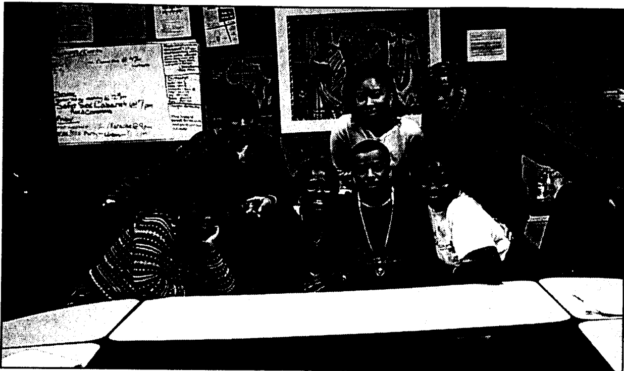
The cast of The Hiphopera .

The Hiphopera is scheduled for February 16, 2001, at 7 p.m., in the Penn State Behrend Studio Theatre. The costs of tickets with college identification are $3 per person, and $5 per person without college identification.