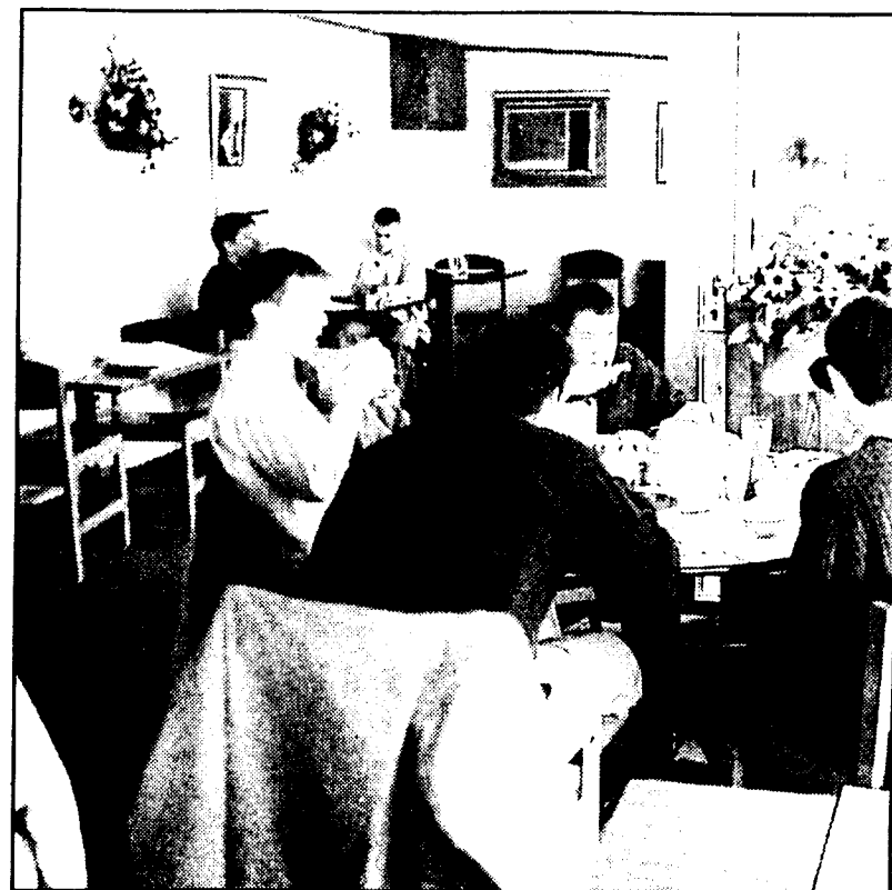
One of the many dining areas of Spada's