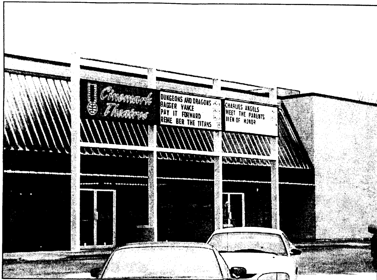
Cinema 6 located outside the Millcreek Mall