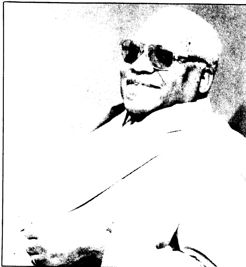
Ellis Marsalis will visit the Behrend campus on Monday, January 15, 2001

In 1989 Marsalis was honored by Dillard University with an honorary Doctorate of Music. Marsalis has recorded 32 albums as well as produced several video projects, including "The Seductress" and "King Midas." Today his music influences jazz fans and artists all over the world. He has won several awards and today holds the Coca Cola Jazz Chair as Director of the Jazz Studies Division at the University of New Orleans.