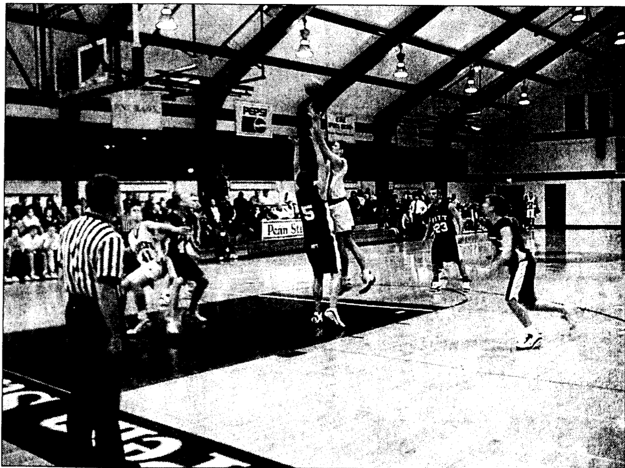
A Penn State Behrend men's basketball player jumps high above Pitt-Bradford in an attempt to add another two points to the men's efforts.