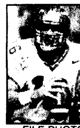
Chris Weinke will lead Florida State in the FedEx Orange Bowl for the national title.