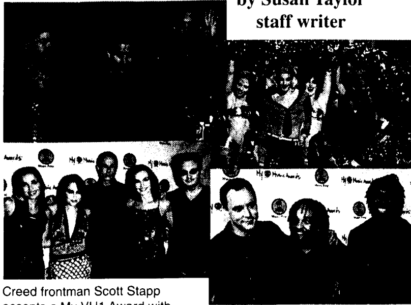
Creed frontman Scott Stapp accepts a My VH1 Award with the band (Top Left). Gwen Stefani finishes a performance with No Doubt (Top Right). Scott Weiland poses with The Corrs (Bottom Left) and the Dave Matthews Band celebrates backstage (Bottom Right).

Another big winner of the evening was Creed, in the "2 For 2," "Welcome to the Big Time," "Group of the Year," "Song of the Year (for 'Higher')" categories. "The fans voting for this award, that gives us the ultimate sense of accomplish-