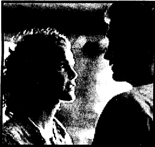
Felicity's Keri Russell (Left) in a deep discussion with a co-star.

When one of the lead characters thought there might have been with a problem with his testicle, he asked his friend for help stating, "Dude, feel my