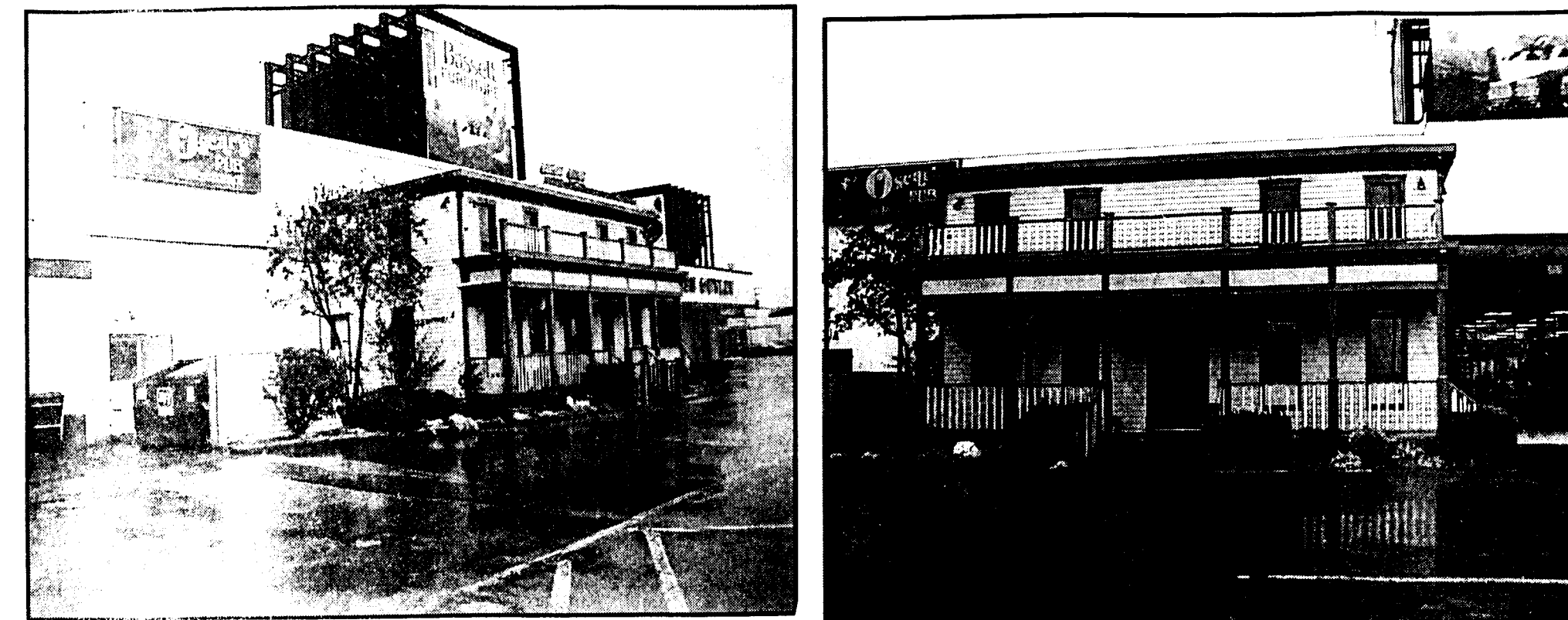
Let that Pth and Pittsburgh Ave.

As we sat down, we were handed a drink menu, and oh what a drink menu it was. I was trying to decide on a good beer, but there are 86 varieties of beer at Oscar's, and twenty of them are on draft. There is beer from all over the world. Good beer, I mean they have beer that you can't even pronounce. Needless to say, I was like a kid in a candy shop. Their selection didn't stop there. The bar itself had a wonderful top shelf filled with 26 different kinds of single malt scotch. not to mention several varieties of nice wines and ports. I would have to say that Oscar's does have the