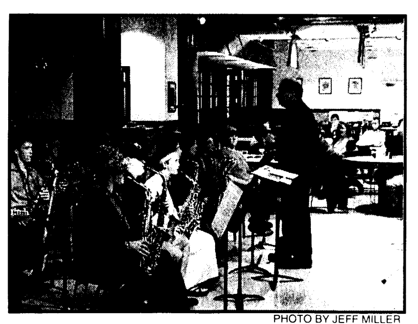
The Behrend Jazz Ensemble in concert at Bruno's

the Studio Singers a warm applause. come of the concert. "Overall, I think the performance went very well and the group put forth a great amount of energy. I was very pleased with the number of people that showed up at the concert. It's always nice to see a full house in a comfortable environment."