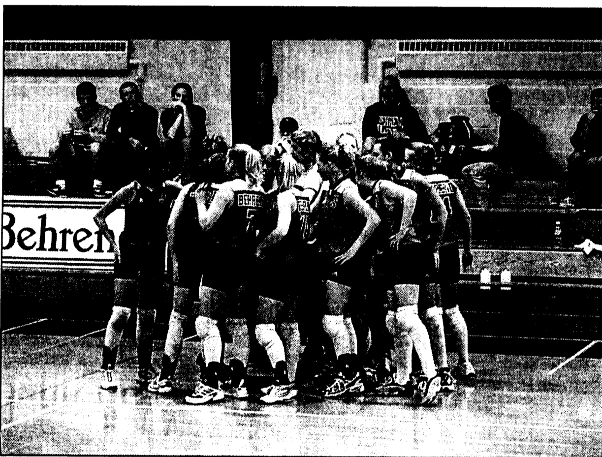
The women's volleyball team huddles up during their match against Pitt-Bradford. Tuesday night moved their record to 8-8.