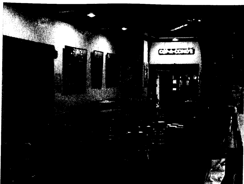
Cup-a-Ccino's is a new college hangout spot

While many people go to "Cups" for an energy boost, that is by far not the only reason to go. Fear of spilling a warm beverage on one-