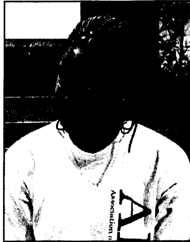
Senator Kim Moses

Don't forget to get registered by October 9!