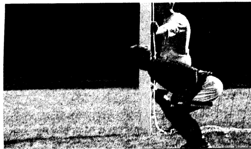
Behrend's fearless net-minder awaits a shot in practice.