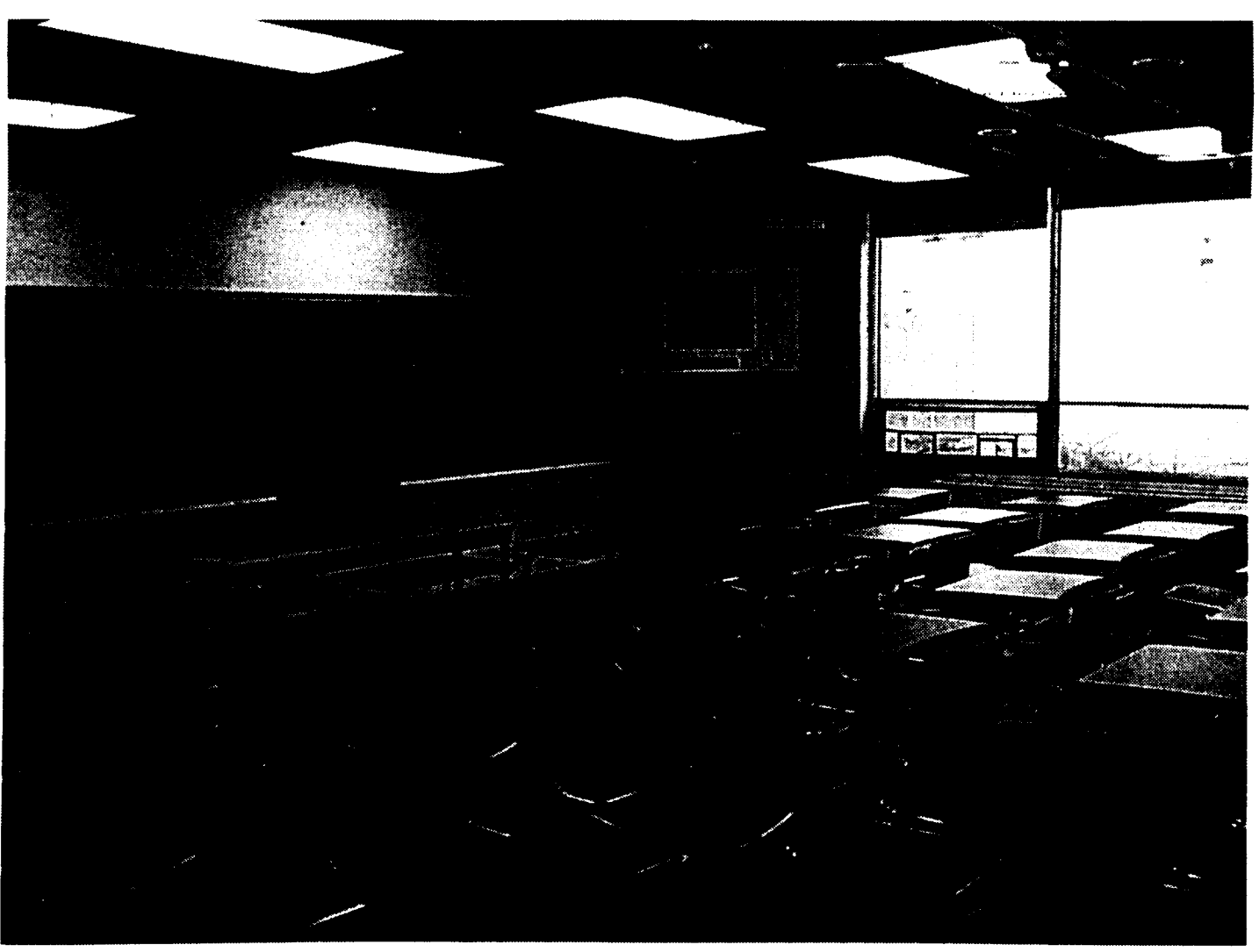
Renovation included some new desks and chairs to make students more comfortable in class.