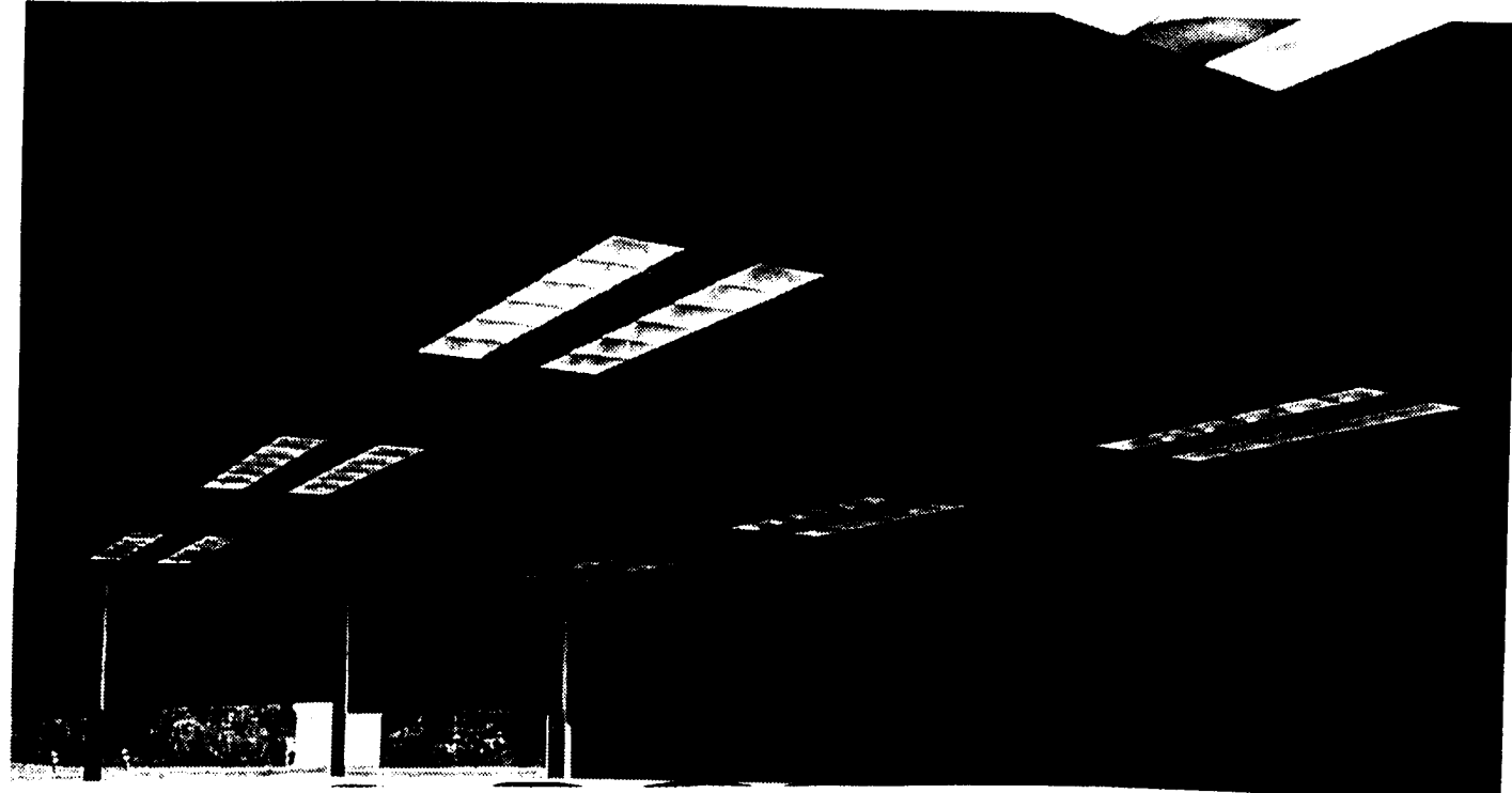
New ceilings and lighting have been added in Behrend's Science Building and Upper Nick.