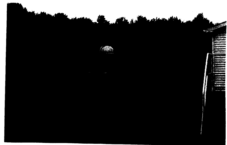
The new observatory has broken ground behind the Science Building.