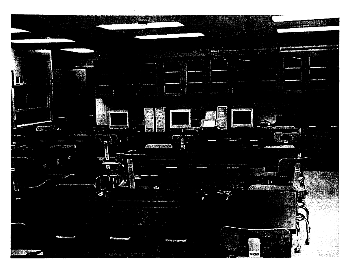
The Biology Department has some new labs to work in this Fall 2000.

Complete coverage of the summer renovations will be in upcoming issues of the Beacon.