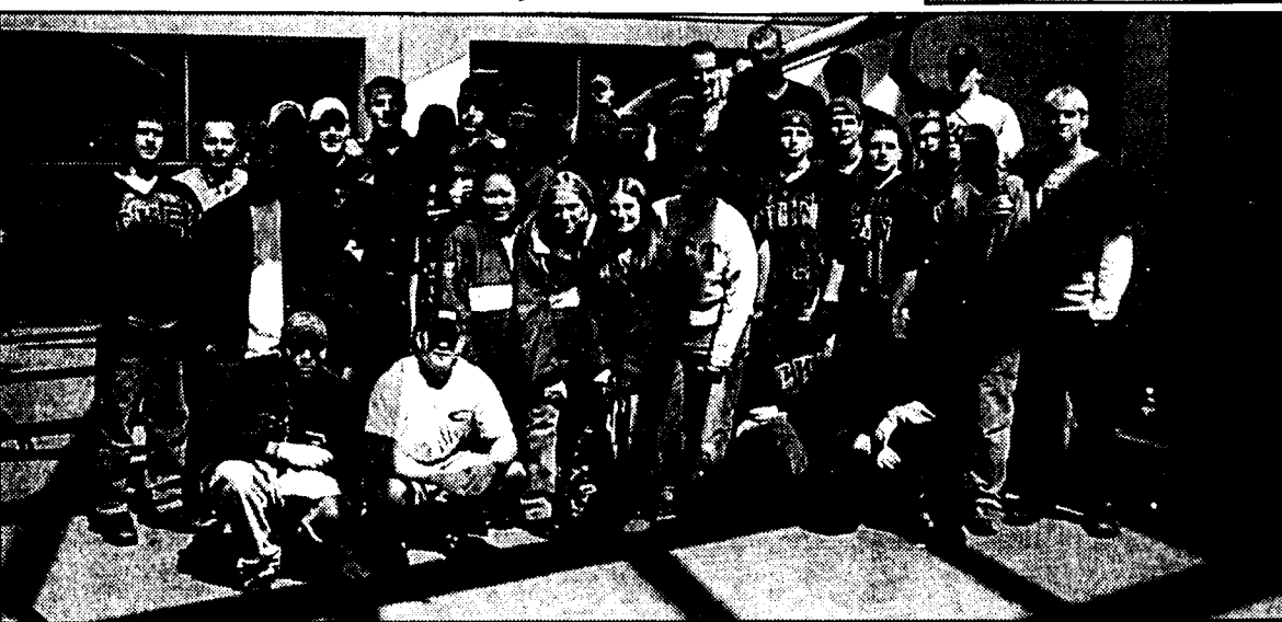
The Greeks take a moment from their service projects to show their Greek pride

for his time and dedication in helping us improve the Beacon . We wish you luck with your move and your future! With him goes the courier font