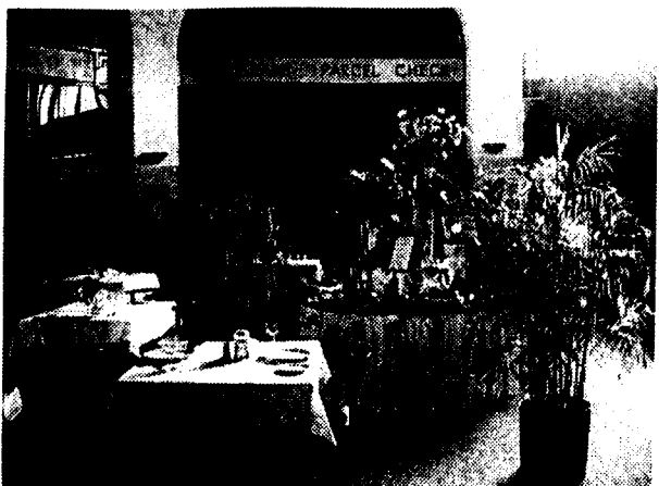
Inside Porters Restaurant's fine dining section