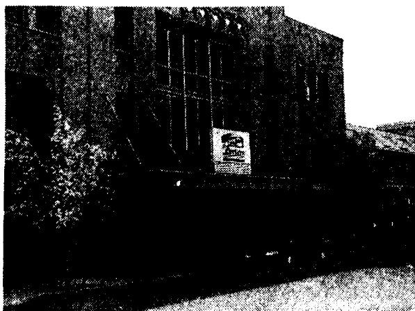
Outside view of Porters Restaurant at 123 west 14th street inside the train station

Everybody should take the time to stop by Porters on 123 West 14th Street, and enjoy the exquisite food, excellent service, and marvelous atmosphere that Porters has to offer. The fine dining menu is served on Wednesday through Saturday, from 5 until 10 p.m. The Tap Room menu is served on Tuesday through Saturday, from 5 until 11 p.m. Dress is casual, reservations are appreciated, and I am positive that you will not be disappointed.