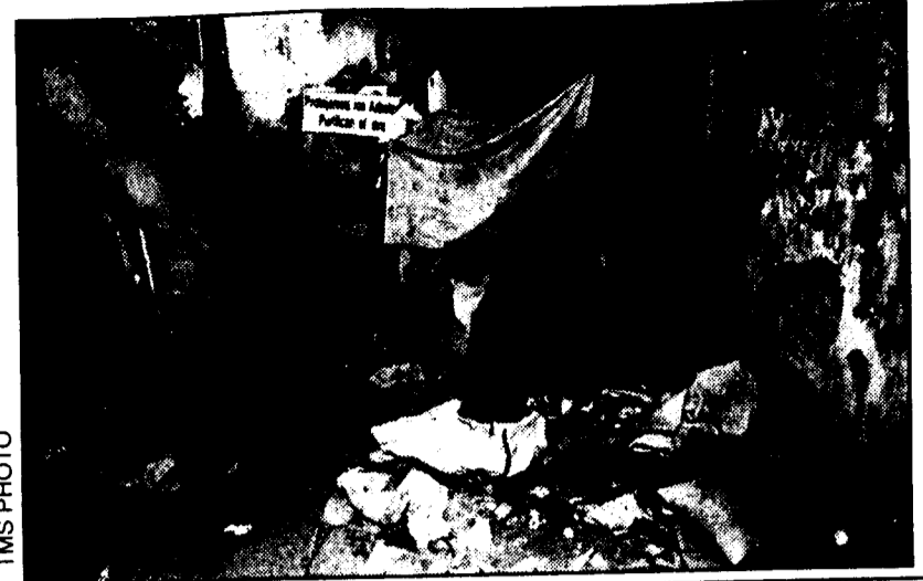
Behrend student lights up in the Reed Commons.