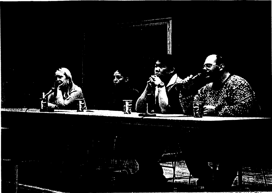
Student speakers at human rights forum.

Amnesty International is an organization that is involved with many issues around the world, including such topics as human rights abuses, freeing political prisoners, and increasing awareness of these and other problems. The Amnesty International organization is relatively new on campus. It holds meetings on Wednesdays at 5:30 p.m. in Reed 112. Anyone interested is encouraged to attend. Additional information about Amnesty International is available from their website www.amnesty.com .