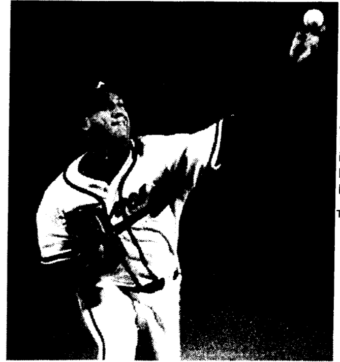
Atlanta Braves pitcher John Rocker pitches against the Detroit Tigers at Walt Disney World in Lake Buena Vista, Florida.

"We're trying to get our team in shape with as little controversy as possible," manager Bobby Cox said. "Everyone is willing to give people a second chance, and this is his."