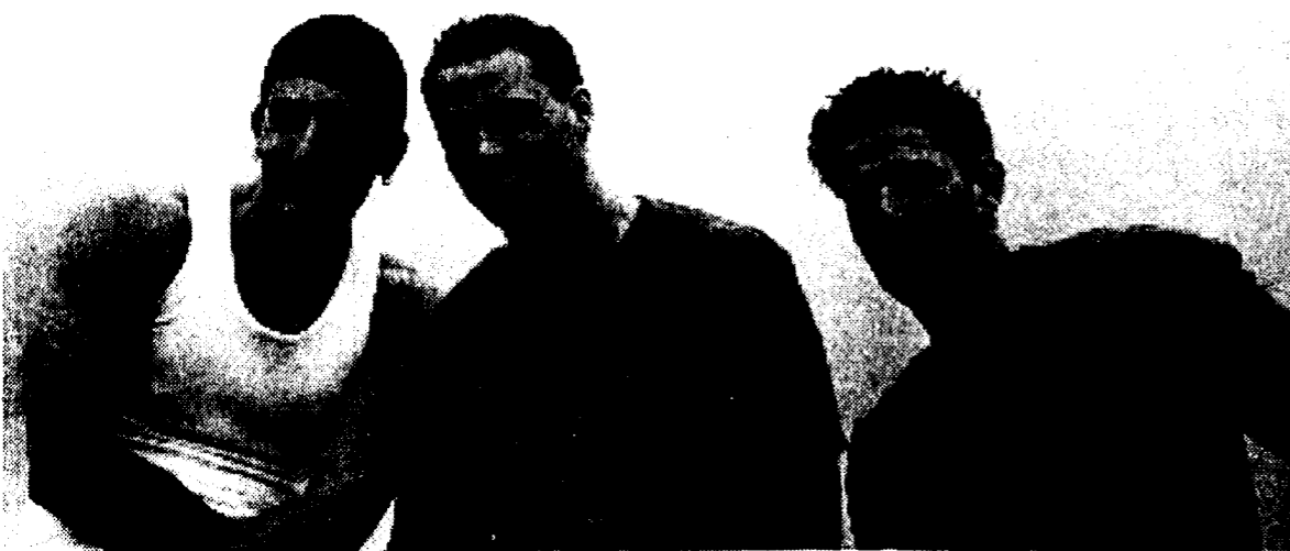
LFO behind the scenes during the making of their video for "Summer Girls"

People everywhere are buying into generic upbeat dance hits and sappy love ballads, and young musical acts are eating the attention up. For some, the evidence may be comforting, but for others, it's sickening. It is a true testimony that this trend will not be going out of style anytime soon, unless of course all the promoters fall off the face off the earth like NKOTB managed to do. But at the same time, how can this be happening? Will anyone ever get enough? And even if they do, we may be in too far over our heads to do anything about it. I can't see these young hip-hopsters going down without a fight, that's for sure.