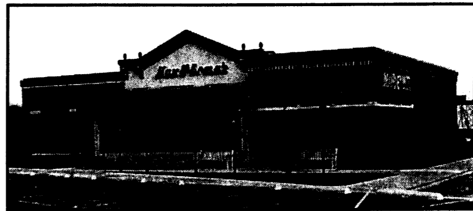
Max & Erma's restaurant located on Interchange Road near Millcreek Mall.

So next time you're hungry for good food at reasonable prices and you're tired of your usual upper Peach restaurants, head to Max and Erma's for a nice break from the ordinary. The restaurant is open from 11:00 AM to 10:00 PM, Sundays through Thursdays, and from 11:00 AM to 11:00 PM on Fridays and Saturdays.