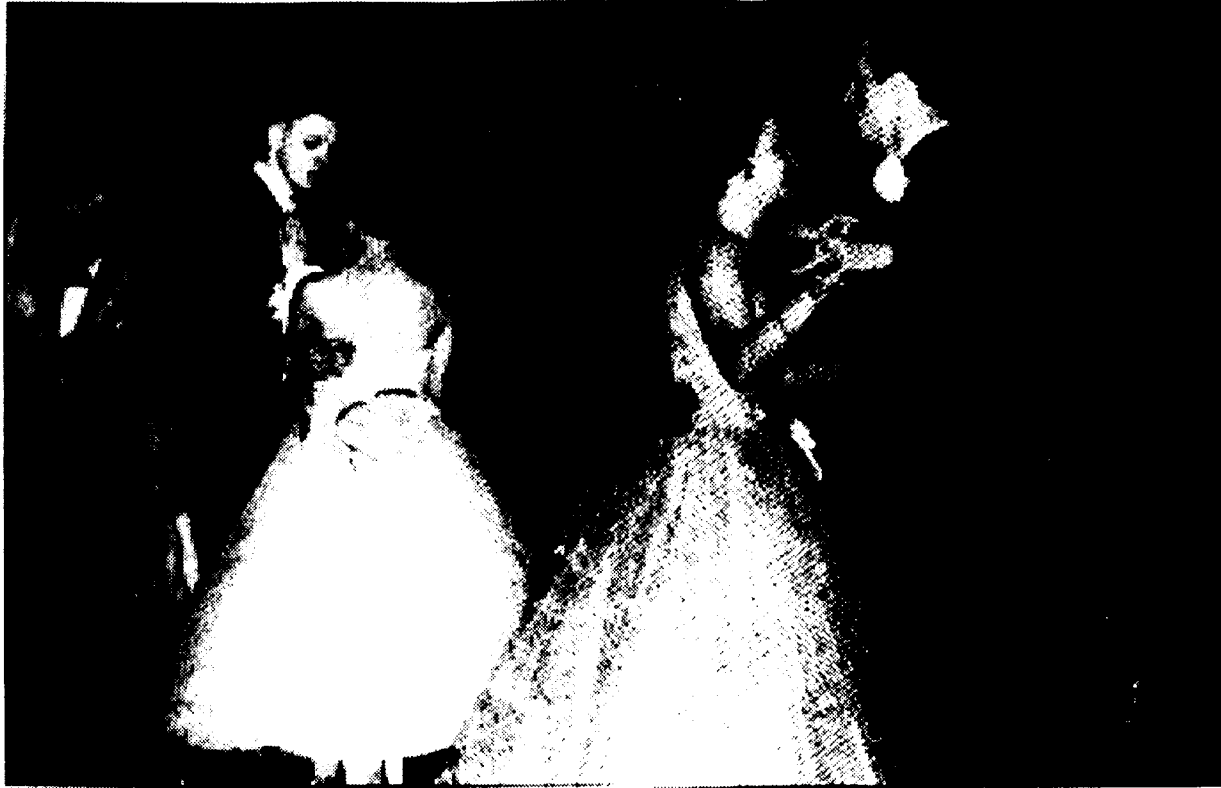
An early dance at Penn State Behrend

The Sno-ball dance always took place shortly before students left for Christmas break. Christmas was a much bigger event on campus then, also. Yuletide festivities began early in December when students and faculty would decorate the campus beginning with the "hanging of the greens." They would proceed to trimming the tree in the student union and having hot chocolate before sledding down by the picnic grove.