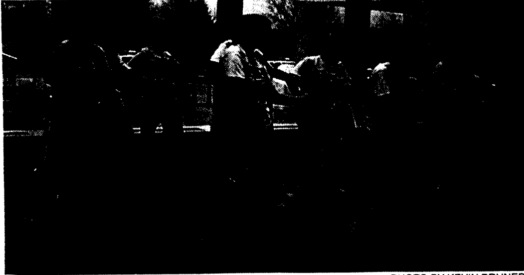
The Behrend dance team performs in the Reed Commons during the activities of spirit stations this past Friday.