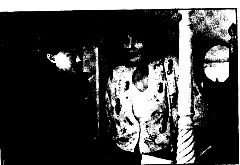
release from Twentieth Century Fox

So repent for your shameful ways and treat your mom to a movie, and of course, accompany her. This movie is enjoyable, and mom will enjoy the time with you.