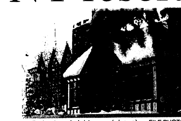
A cottage (below) and clubhouse (above)

Before you leave, don't forget about the Peek's indoor pool, sauna, indoor/ outdoor hot tub, game room, fitness room, and ski shop, all perfect to finish off a winter evening. For more information on specific Peek rates call 716-355-4141 or go to the Peek 'N Peak homepage at www.pknpk.com/ <a href="http://www.pknpk.com/">.</a>.