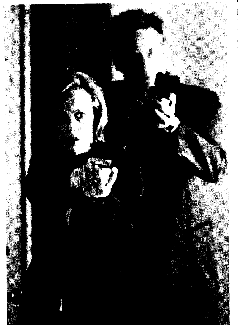
Agents Mulder and Scully ward off the living dead and help in the new year

the enigmatic Agent Scully. So while people all over the country were feasting on turkey and gelatinous cranberries, thousands were gorging themselves on the Files.