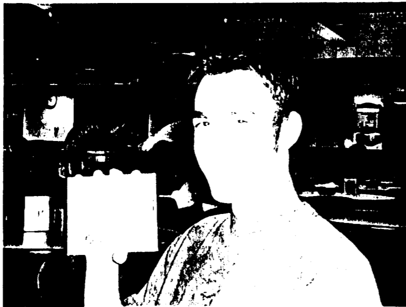
A Behrend student shows off his Microsoft Office program that were given out at the Computer Center.

quantities of these titles available for students, but more will be available soon from Microsoft. With Microsoft Office 2000 costing upwards of $200, the contract with Microsoft will result in great savings for students who use these programs for their classwork.