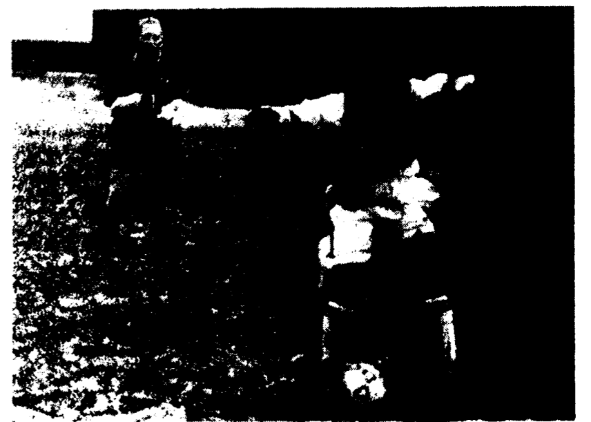
In an early snowfall, the Penn State Behrend women's soccer team prevailed in the opening game of the ECAC Championships.