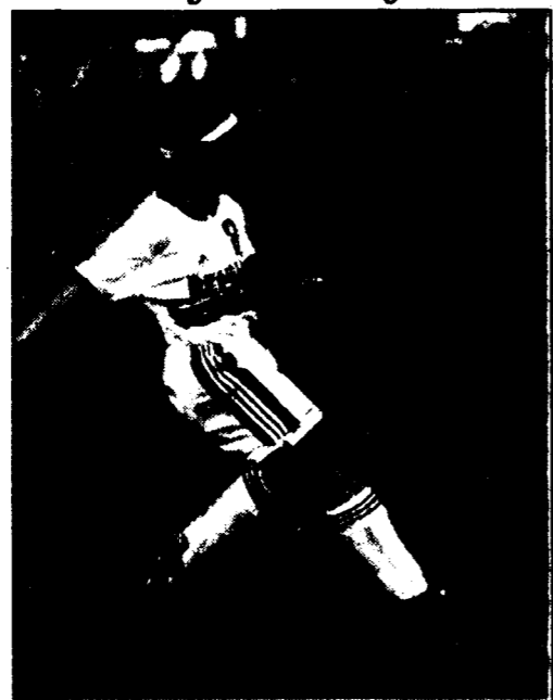
Women's soccer hosts the AMCC Tourney this weekend.

From the start the women's tennis team was poised to win their third AMCC title in as many years. Behrend dominated the AMCC from the beginning of the season and they ended up with an overall record of 17-2. Most important their confer-