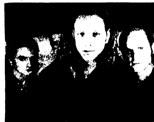
Angry Salad will open for Train in the upcoming show in Erie Hall file photo