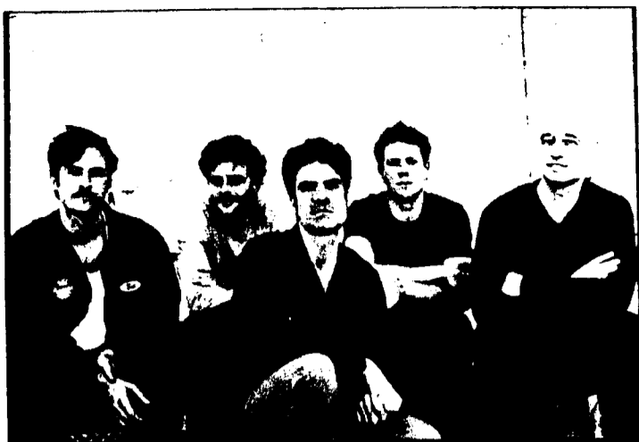
Train members starting from left: Charlie Colin, Rob Hotchkiss, Patrick Monahan, Scott Underwood, and Jimmy Stafford