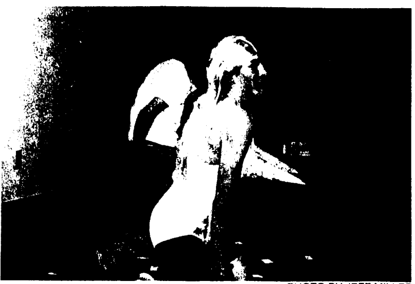
"Madonna" makes a special appearance at Greek Sync during the festivities of Greek Week.

ternities' first place winner was ZBT, they could. First place winner for the their performance. ZBT has won this STG.