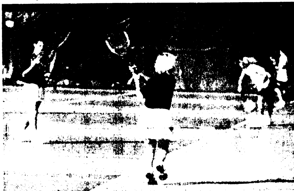
The Penn State Behrend women's tennis team will be traveling to the AMCC conference tournament this weekend. The Lady Lions have dominated the AMCC this season with a 10-0 conference record.