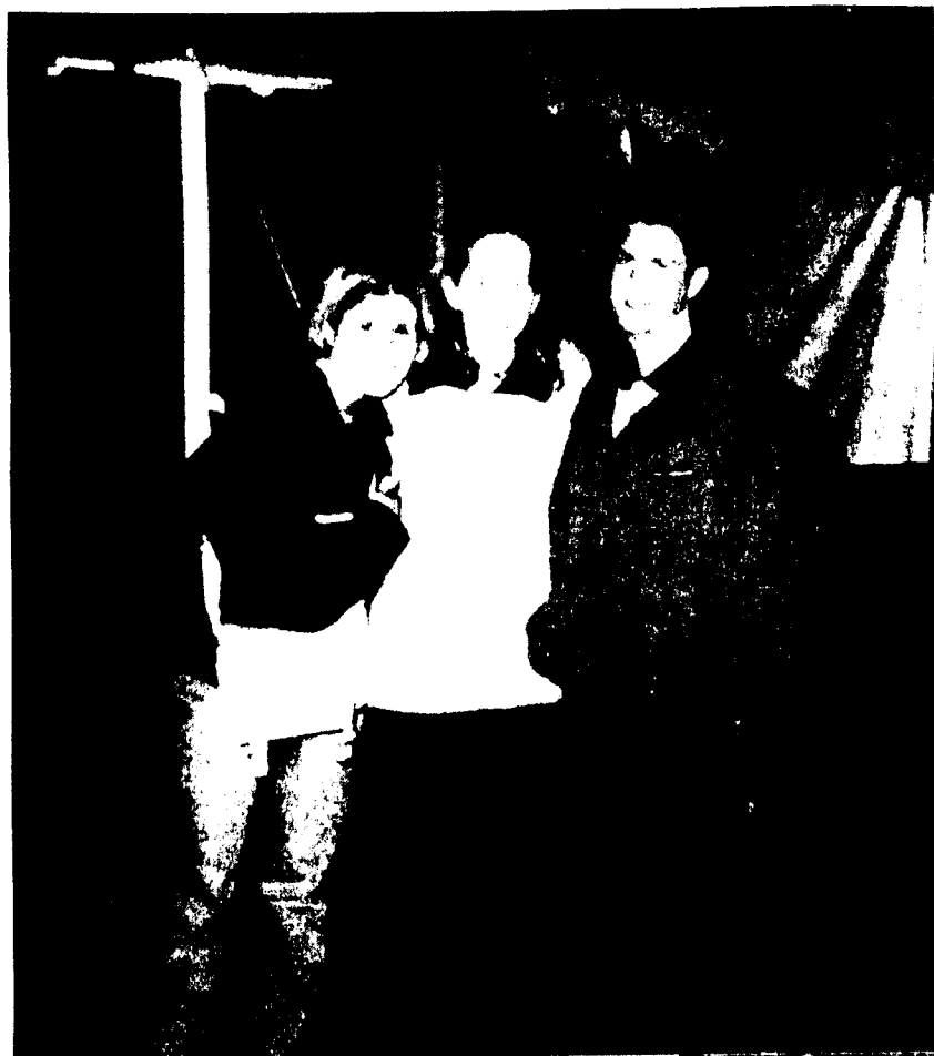
Friends have fun at Parents and Families' Weekend.