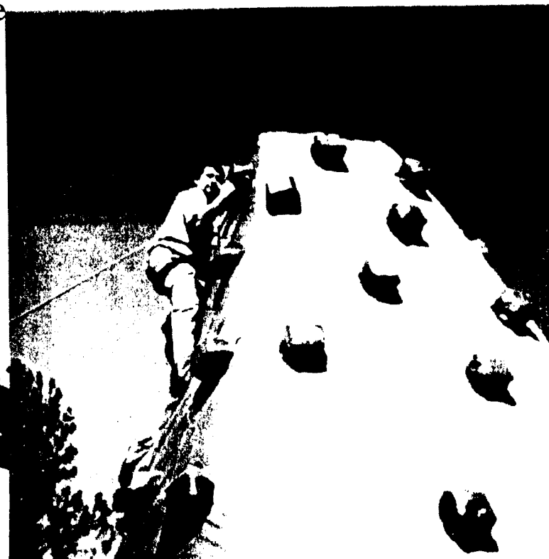
Behrend student makes his climb to success.