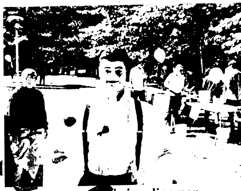
This juggling performer was one of many attractions at Fall Festival '99.