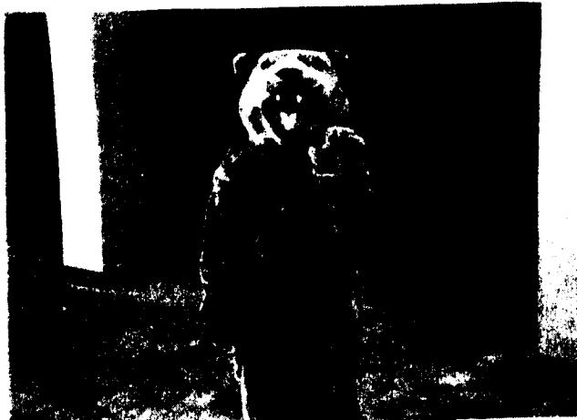
This lion isn't very vicious, but shows tons of spirit.