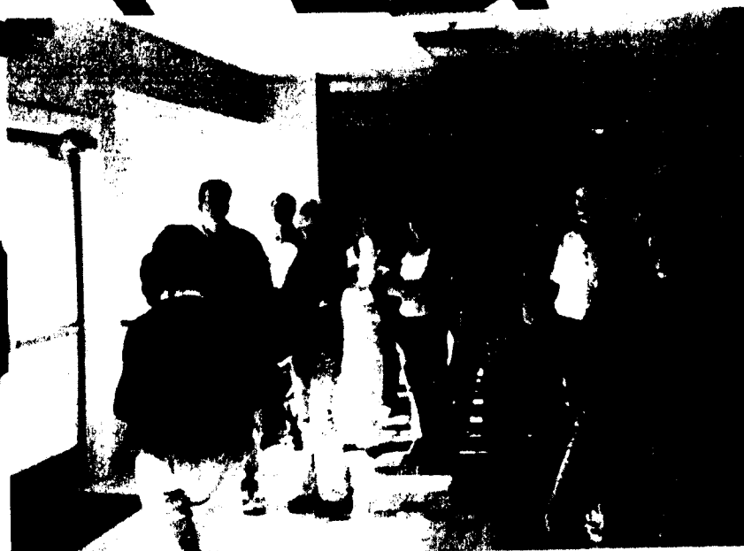
Campus tours were given to next year's prospective freshmen.