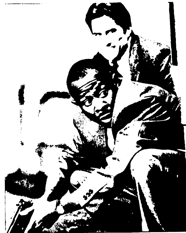
Martin Lawrence and Luke Wilson in Blue Streak

The movie's hot soundtrack, which includes Jay Z's Girl's Best Friend , should also help in boosting box office numbers. However, the movie is still great without the soundtrack. I make this point because, lately, there has been an influx of bad movies with hit soundtracks that attempt to make up for a film lacking in entertainment. Blue Streak is not one of these. The movie is great fun to watch. Yes, I said "fun," a word that is used less and less when referring to movies these days. I advise moviegoers to see Blue Streak because who knows the next time you will have the opportunity to leave the theatre with a smile on your face.