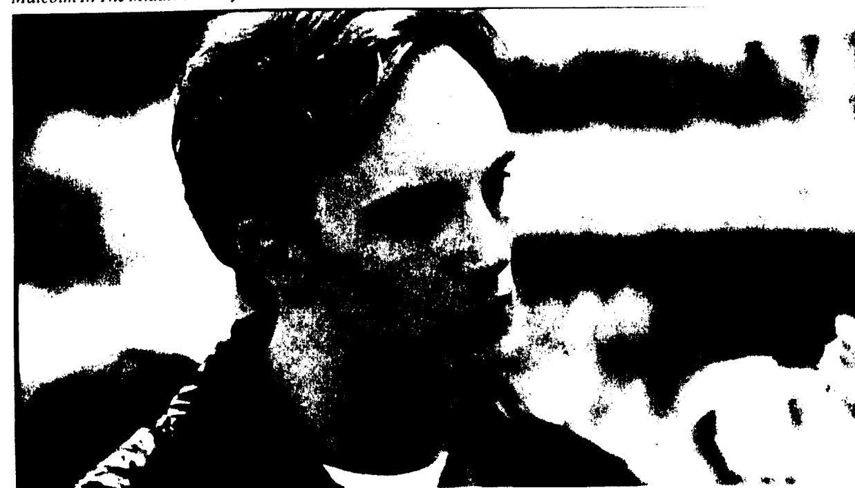
Jay Mohr stars in Action , the new adult series on FOX