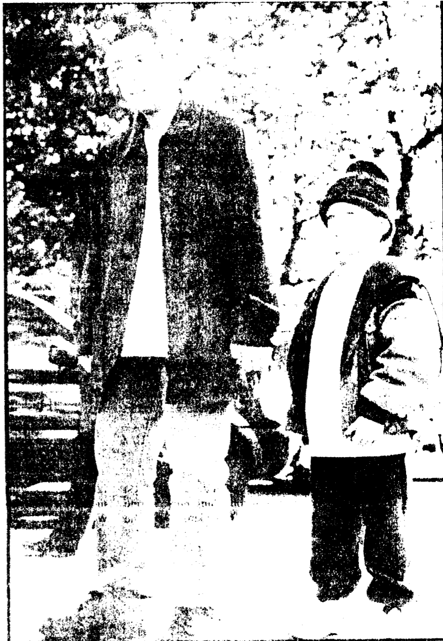
Adam Sandler stars as Sonny Kofax in Big Daddy.

And finally, what does this all mean? Well, the good news is that with the exception (again) of South Park , critics were only mildly appreciative of these comedic efforts and they were essentially ignored. Mediocre, even bad reviews at times, could not, would not shake the faith of the average moviegoer, proving that the pen (though still mightier than some things) is not stronger than our need to laugh. Critic-proof movies made a lot of money this summer, but they also gave catch-phrase success to people who aren't, oh I don't know...Tom Cruise.