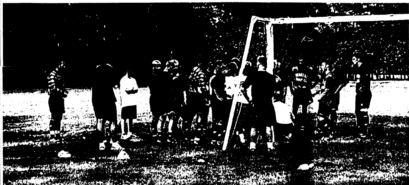
The men's soccer team talks strategy in preparation for this weekend's Herb Lauffer Memorial Soccer Tournament.