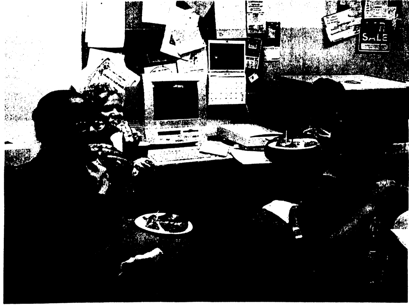
Beacon staff writers at the pizza taste test contest