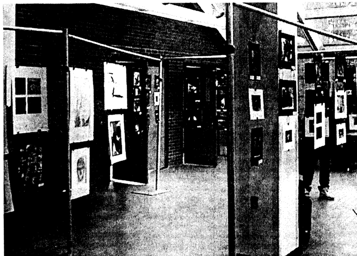
Students majoring in everything from engineering to psychology will have their artwork on display in the Reed Union Building Wintergarden at the Behrend College from April 16-30, 1999.