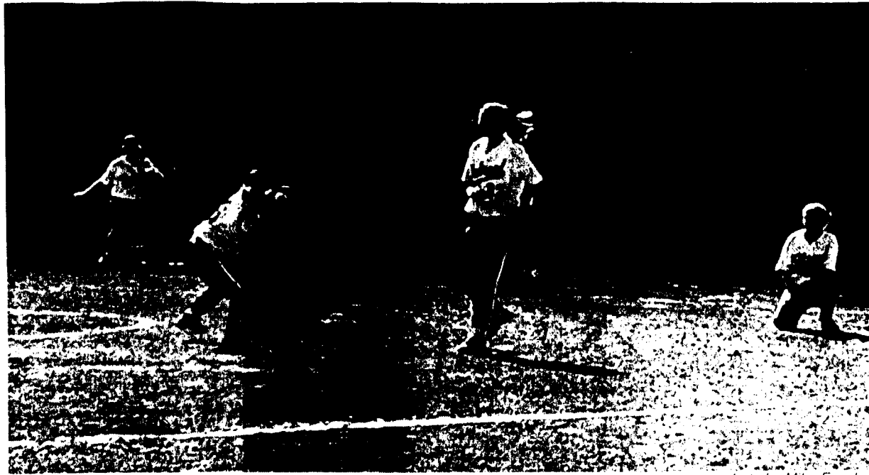
HOME SWEET HOME: The Lions feel right at home as they will host the AMCC Tournament this Sunday

The tournament begins with Behrend vs. Pitt-Bradford at 11:00 a.m. on April 25th. The second game, LaRoche vs. Frostburg State is slated for 1:00 p.m., and the championship is at 4:00 p.m.