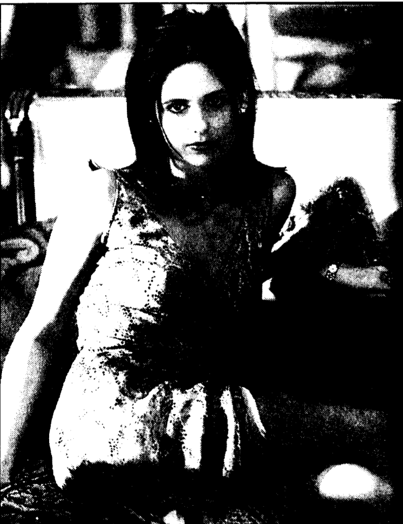
New Humanities and Social Sciences Director, Sarah Michelle Gellar

There is speculation that Gellar is planning to teach some of these courses herself, as her life experience will be valuable in demonstrating some of these skills.