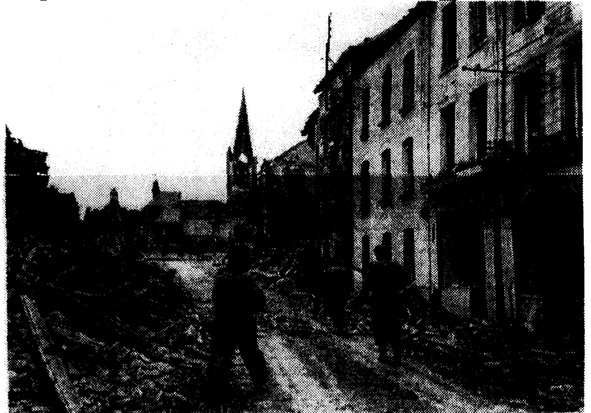
Burnt out remains of Niagara Hall