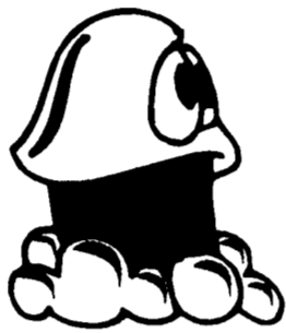
Our new editor-in-chief, Bob the Scrubbing Bubble

Governor Tom Ridge has approved calling out the National Guard to put down the riots and place the campus under martial law. He is hoping that the riots can be put down with minimal loss of life, and the ringleaders of the rioters, who at this point remain unknown, can be brought to justice.